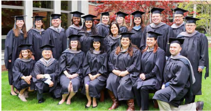
MS in Food Safety Graduates Walk at Spring Commencement